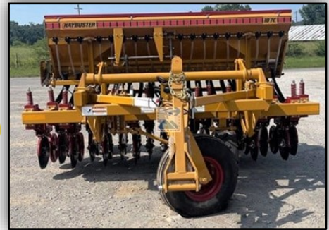
Haybuster 10' wide

The Clark County Conservation District currently has two seed drills ( see pictures at right ) that are available for rent at a rate of $5.50 per acre with a minimum of $55.00 if less than 10 areas are used.