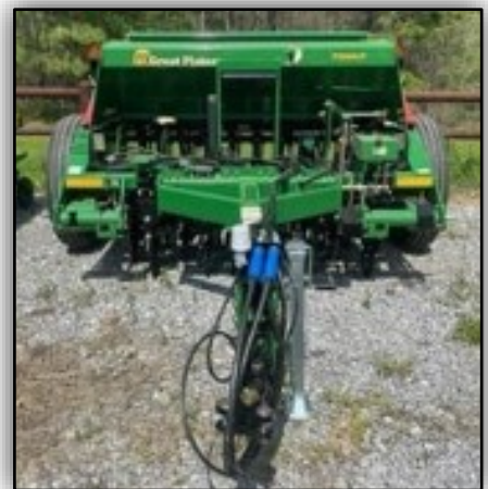
Great Plains 7' wide

For more information about availability contact the conservation district office at (859) 744-2322.