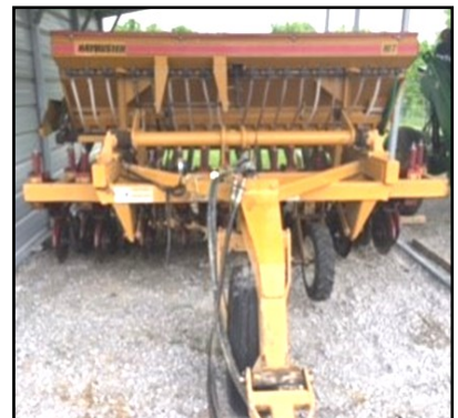
Haybuster 10' wide

For more information about availability contact the conservation district office at (859) 744-2322.