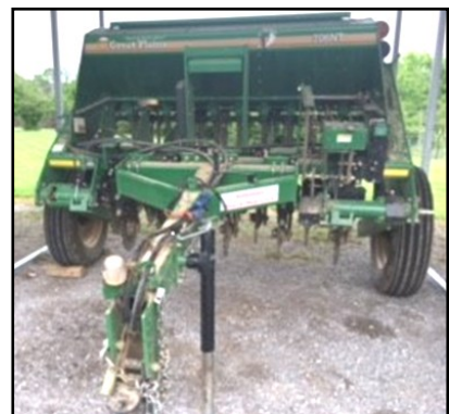
Great Plains 7' wide